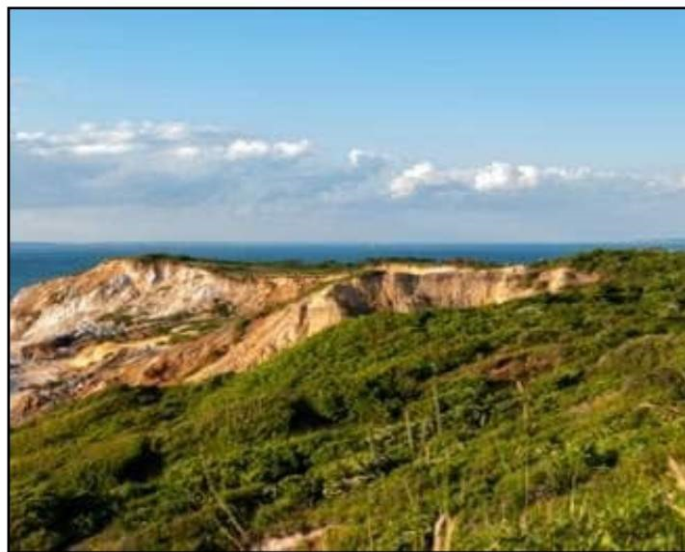
Martha's Vineyard