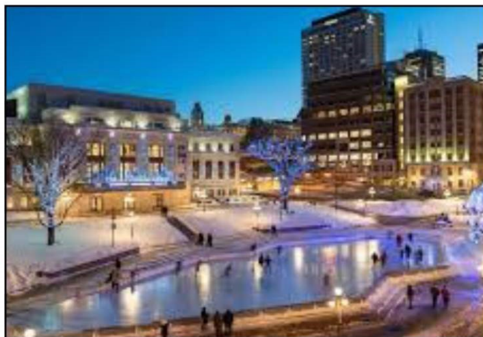
Quebec City